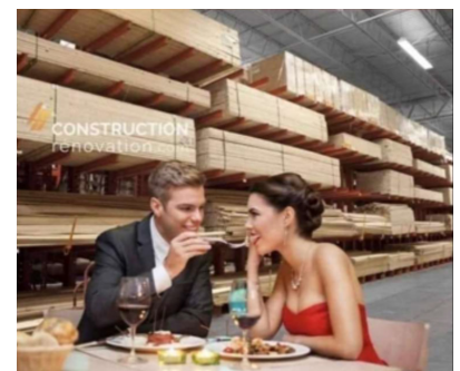
"Take me somewhere expensive"